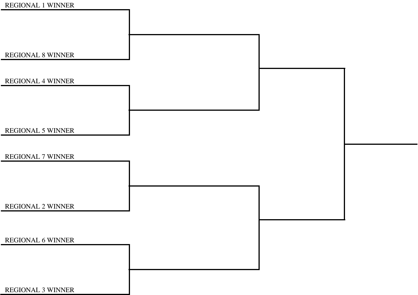
DIAGRAM 2—State Bracket for Classes 5A and 6A