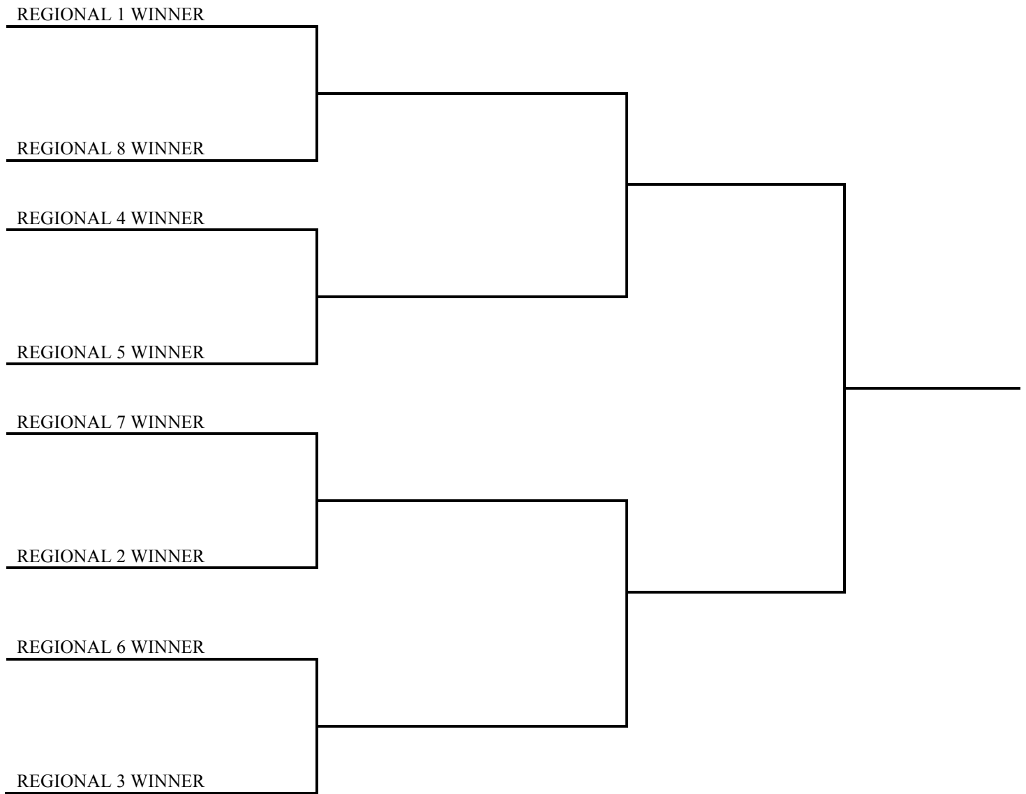
DIAGRAM 2—State Bracket for Classes 4A, 5A and 6A